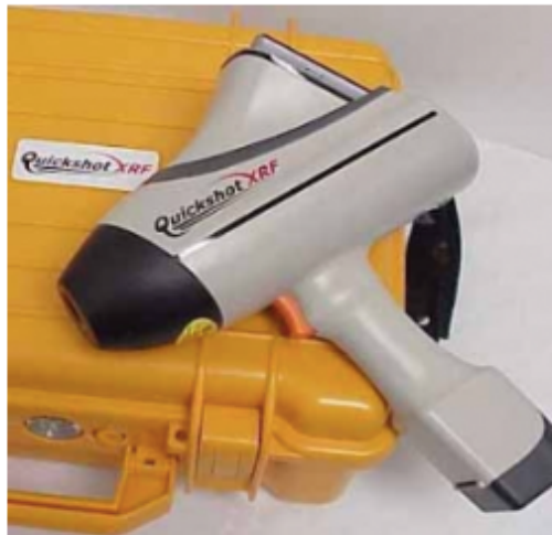
The Center for Environmental Health uses an X-ray fluorescence analyzer to screen for lead

To determine how much lead was in the jewelry, each part of the item had to be tested. That meant separate tests for the chain, clasp or charm.