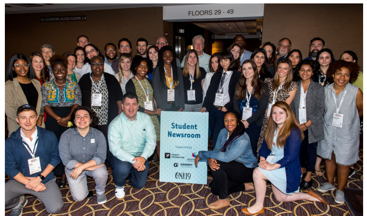
The 2019 Student Newsroom members and their mentors during the first day of the ONA19 conference.

Stories they produced covered topics such as navigating parenthood and a journalism career, climate reporting and the industry's union movements. Students also gained sourcing and breaking news experience when a double-booking led to a last-minute venue change for the conference's opening reception. ■