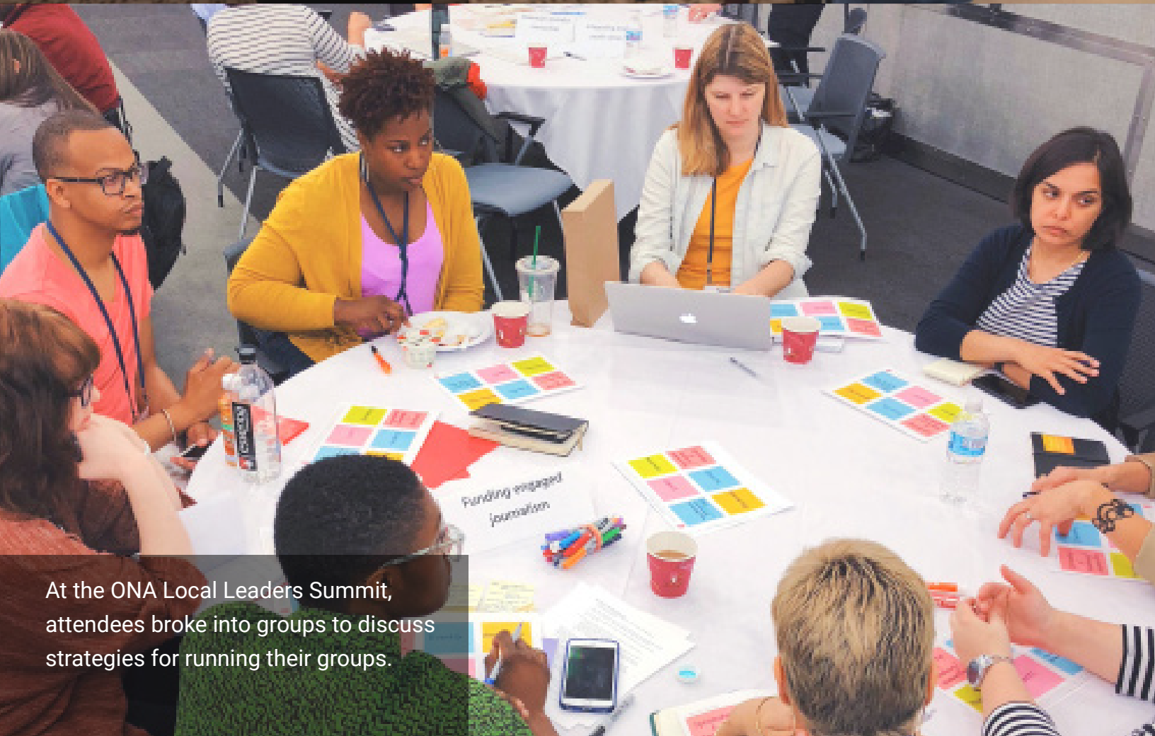
At the ONA Local Leaders Summit, attendees broke into groups to discuss strategies for running their groups.