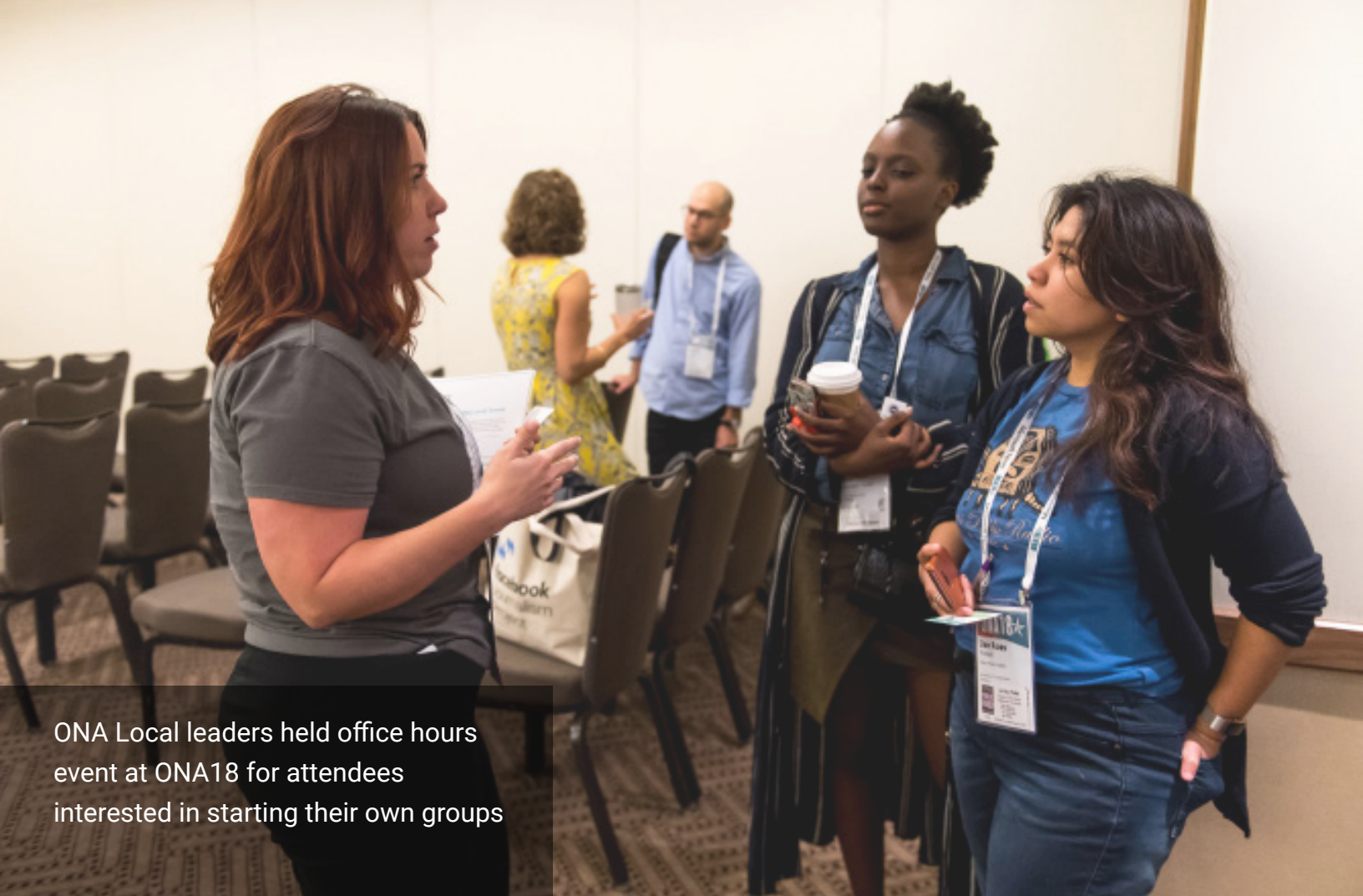
ONA Local leaders held office hours event at ONA18 for attendees interested in starting their own groups