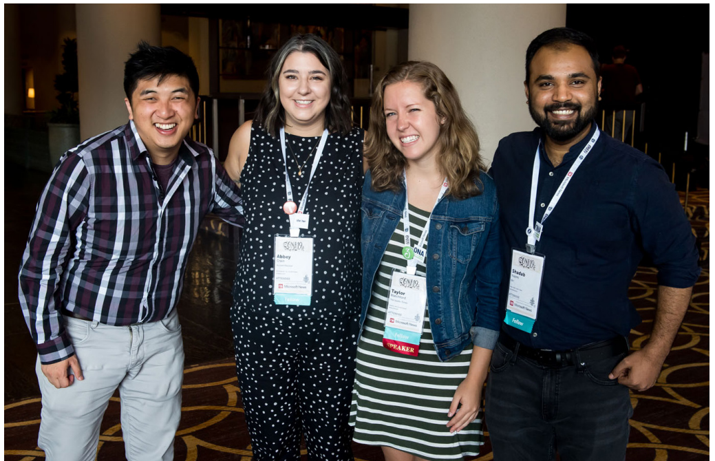
The 2019 MJ Bear Fellows at ONA19.

The MJ Bear Fellowship honors outstanding journalists under 30 whose work in independent, community and corporate news represents the best of new media. Thanks to additional support from Microsoft News, ONA expanded the Fellowship in 2019 and selected six fellows from around the world leading innovative digital journalism projects.